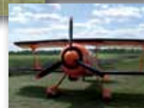
Pitts Model 12

Available for almost every aerobatic aircraft, for custom built airplanes like Lancair, Velocity, Glasair or RV and for more than 100 certified aircraft types.